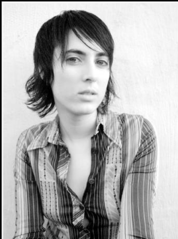
© Andre Costantini using the Tamron SP AF28-75mm F/2.8 Di the Fujifilm S2

Nikon AGFA OLYMPUS Canon EPSON Kodak FUJIFILM WE CARRY OVER 20,000 PHOTOGRAPHIC ITEMS IN STOCK