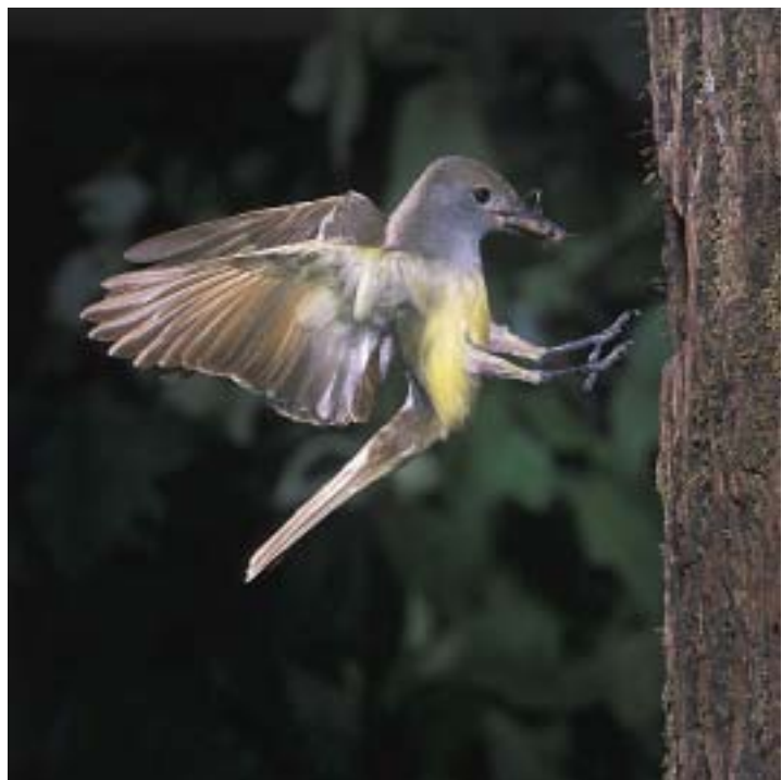
Great Crested Flycatcher Phil Echo