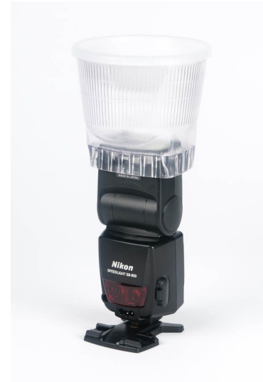
Gary Fong Lightsphere fitted to Nikon SB800

If you've ever taken a photo with the hot-shoe flash pointed directly at your subject you know just how unflattering and harsh that type of lighting can be. One simple way to improve your on-camera lighting is to use a flash diffuser. The Lightsphere, by Gary Fong, is a flash diffuser constructed of a flexible vinyl with an opaque snap-on lid. The Lightsphere comes in two versions: cloud or clear. The cloud version is more opaque than the clear, and provides even more light diffusion. For this review, I evaluated the Lightsphere's cloud version and could see that the Lightsphere would be very useful for portrait and event photography. It's almost like putting a small softbox on your flash. It measures 4 ½ inches in diameter by 4 inches tall, making the Lightsphere easy to pack into your camera bag. The Gary Fong Lightsphere is available in three sizes that will fit nearly all major manufacturers hot shoe flash units.