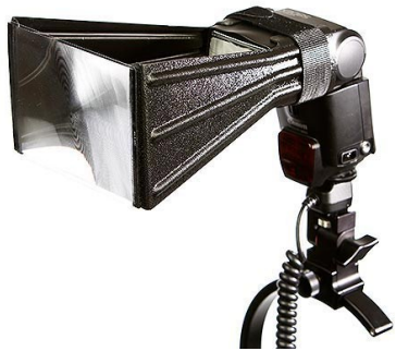
Visual Echoes Better Beamer

At the opposite end of the flash modifier spectrum is the Visual Echoes Better Beamer. The purpose of the Better Beamer is to extend the reach of your hot-shoe flash. This is a very popular flash accessory with nature and bird photographers. The Better Beamer allows photographers to use fill-flash outdoors even while shooting with very long focal length lenses. It is a simple device consisting of two side braces, a velcro strap, and a Fresnel lens. I found it easy to mount the Better Beamer to the front of my Canon 580EX flash. When it's not on the flash, the Better Beamer folds almost completely flat making it easy to store. The Better Beamer's Fresnel lens helps focus the flash beam pattern and will add approximately two stops of light output to your flash. The Better Beamer is made in seven different sizes to fit nearly all major flash units.