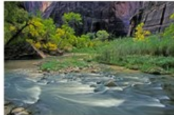
PHOTO & VIDEO EST. 1989 Hunt's

Like us! Follow us! Add us! For deals, photo contest, educational promos and more. Hunt's Photo Social keeps you up to date on your favorite social beat.