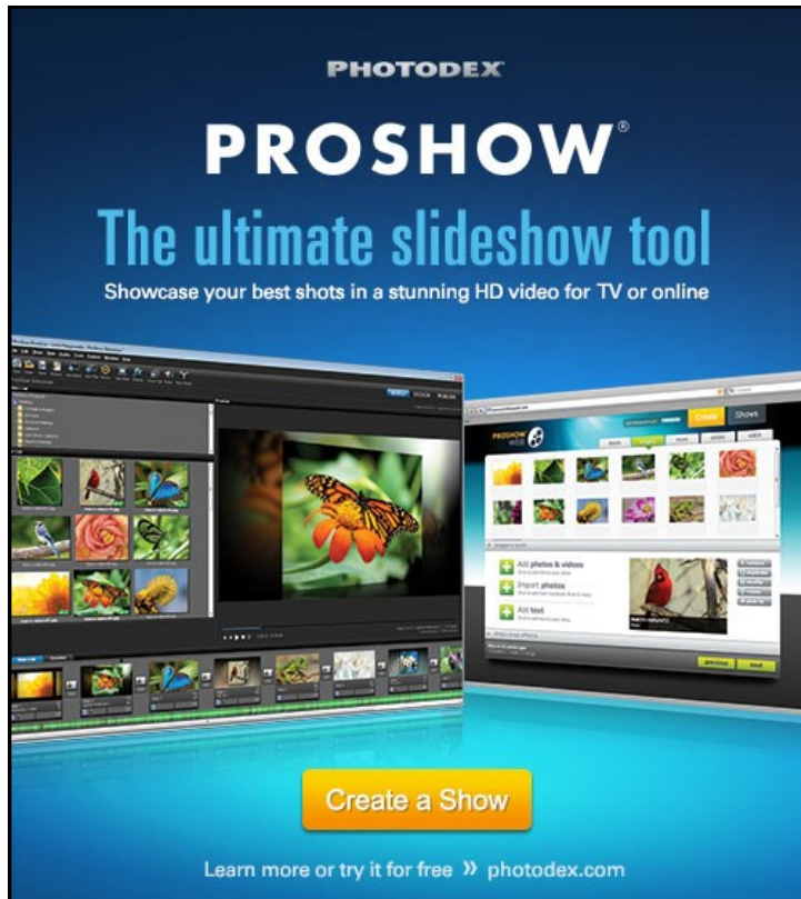
PHOTO & VIDEO Hunt's

100 Main St. Melrose, MA 02176 (781) 662-8822 alansamhunts@gmail.com