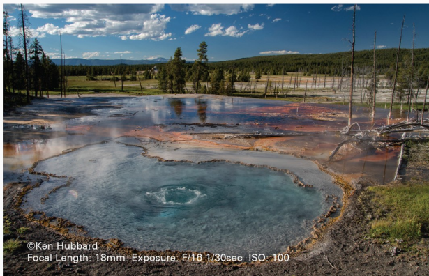
Focal Length: 18mm Exposure: F/16 1/30sec ISO: 100