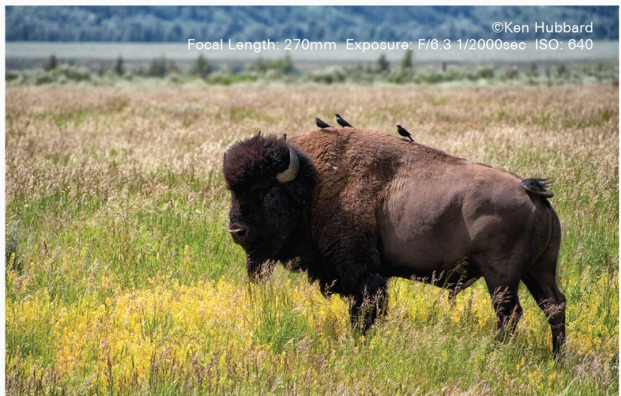
Focal Length: 270mm Exposure: F/8.3 1/2000sec ISO: 640