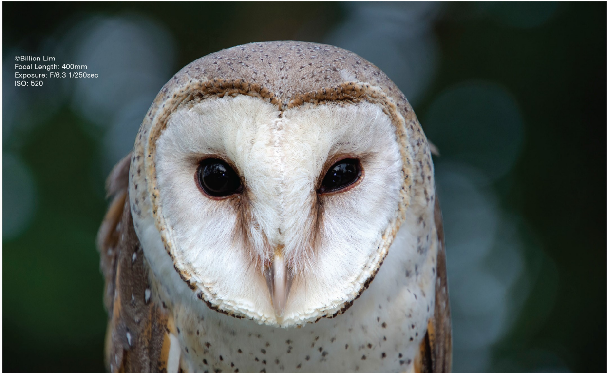
Focal Length: 400mm Exposure: F/8.3 1/250sec ISO: 520